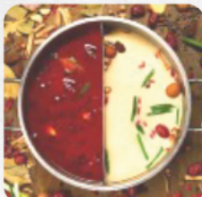
Dual Hot Pot 鸳鸯锅

Our broths are available as a single Hot Pot or