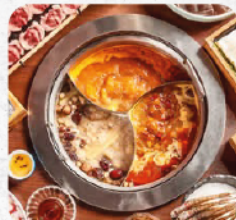
Triple Hot Pot 三味锅 (for larger tables only)

BOTTOMLESS SOFT DRINKS Only £1.99 (Coke Zero/ Diet Coke/Vimto/IrnBru/ Sunkist Orange/Lemon & Lime) per person