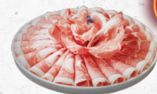
快乐羔羊卷 Happy Spring Lamb