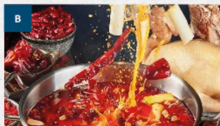
B Spicy Marrow Chicken Broth 内蒙清油香辣锅