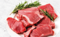
A眼肥牛 Rib Eye