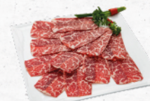
大雪西冷牛 Snowflake Beef Sirloin