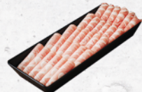
精选肥羊卷 Chef Selected Lamb