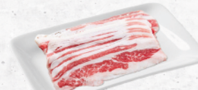
特级牛小排 Superior Short Ribs