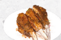
快乐烤羊排 Marinated BBQ Lamb Ribs

Dishes on set menu are included in Deluxe menu. 套餐的菜肴包含在豪华套餐中。