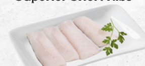
海鲈鱼 Fresh Sea Bass