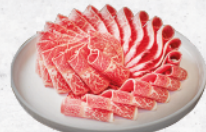
快乐牛板腱 Happy Shoulder Beef